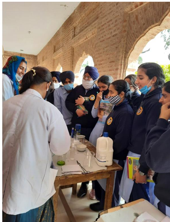
School students watching and learning the scientific experiments with curiosity on Chemistry Magic Show held on 03-03-2021